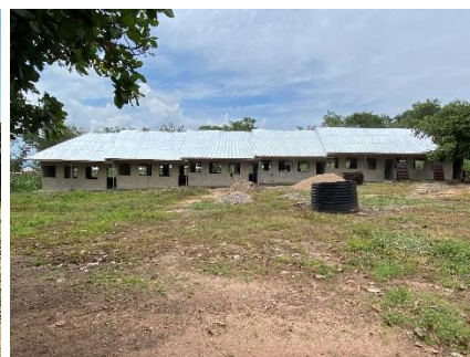
New six classroom block

Our Okunran school continues to grow and develop as a “real school” for Nigeria. We are in the process of finalizing the government requirements and getting our status to be able to give out certificates for completing primary 6 level. We are not there yet as we need to be for 2025 when our first set of primary 6 will graduate.