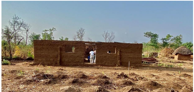
Another new church in the bush

Education still is a great opportunity to reach communities that are reluctant to the message of the Gospel as many are realizing that they are being left behind. This bridge is a wide path to bringing many to learn the ABC's but at the same time to be together with other tribes and Christian teachers.