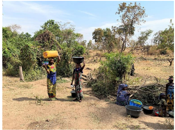
Preparing food and fetching water from a dry river bed