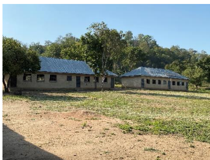
Two classroom blocks