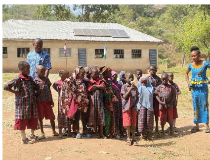
Classroom end of the year performance

If you asked me to dream.....of the possibilities....what is next? I am not really sure as I can only trust the Lord. Yet when I see the seriousness of the bush people here, I get really excited. I hope to be able to hire another teacher to help this school as 74 children is too much for one teacher to sustain. I also hope to make this particular school a little more stronger and water resistant. I would like to dream of putting metal poles as the sticks to hold the roof and put on a metal roof so that the water will not come down on the children during rainy season. I would like to have real benches and tables for them if possible. So, as we take a season break for Christmas, I pray that some of these dreams can come true.