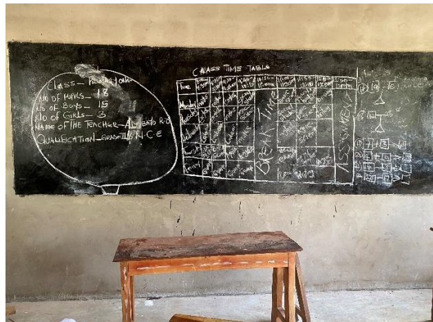
Hammude School logo and one of the blackboards of the new 6 classroom block