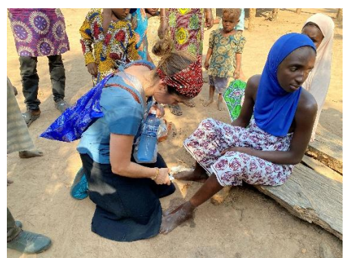
Medical nurse volunteers doing follow-up in the bush