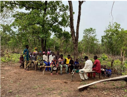
One new congregation

Our ministry has had the opportunity to work with the local established church in bringing national missionaries to come and serve in the region. Some of the missionaries are placed in the small cluster of new believers and some have been able to start new churches, and some are in the very remote locations of the bush camps. We thank you for the support in being able to supply a motorcycle for many of the new missionaries. This will allow much more movement and outreach into the difficult places. Our partnership with the EMS (ECWA Mission Society) and the DCCs (District council of churches) has been a learning curve as the Lord teaches us to work together for the bigger goal of reaching lost souls for the Kingdom of God. New churches are being established in some of the more remote and bush regions.